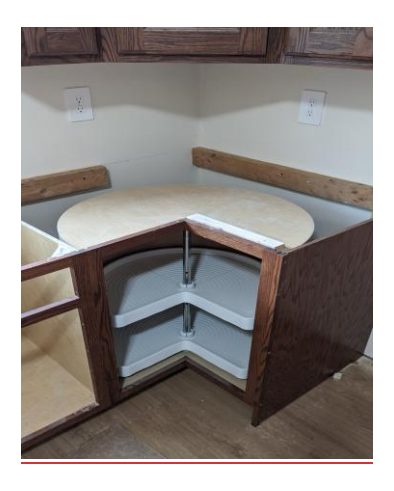
Figure 17-3. Showing Countertop 2x4 Corner Supports.