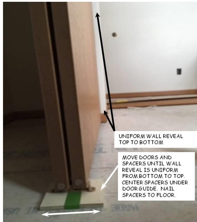
Figure 18-4. Shim Adjustment for Uniform Door Reveal.