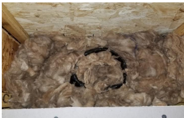
Figure 12-2. Insulation Filled Around Future Fan Vent Duct.