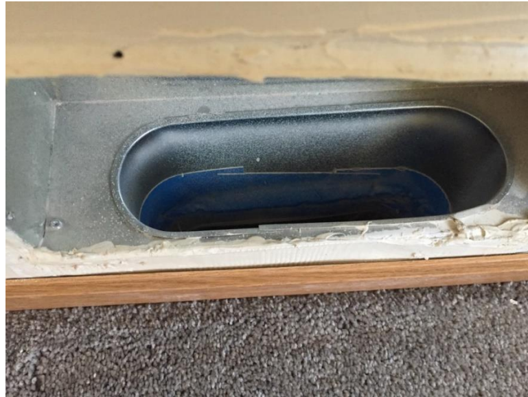
Figure 12-5. Sealing Cold Air Return Joints

NOTE: The tape shown in Figures 12-4 and 12-5 is flashing tape, not HVAC tape. Instead, be sure to use the silver HVAC tape for sealing ducts.