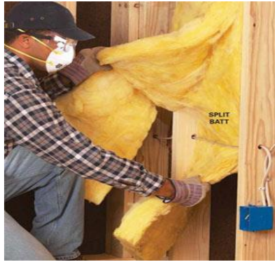
Figure 12-6. Insulating Around Electrical Wires.