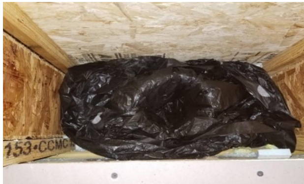
Figure 12-1. Plastic Bag Inserted Into Future Fan Vent Duct.