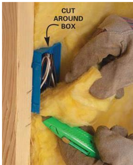
Figure 12-7. Insulating Around Electrical Box.

EXAMPLE: If the box measures 4” for the height, 3” for the width and 3” for the depth, cut out the insulation only to that size. Be sure to install insulation behind the box.