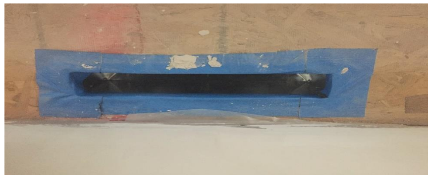
Figure 12-4. Sealing In-Floor Heating Duct.