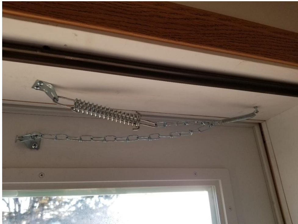
Figure 20-1. Storm Door Wind Chain.