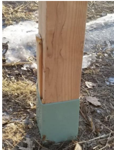
Figure 20-3. Installation of Mailbox Post.