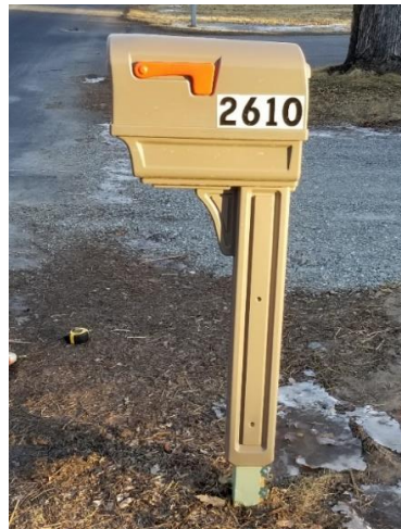
Figure 20-4. Curbside Mailbox.