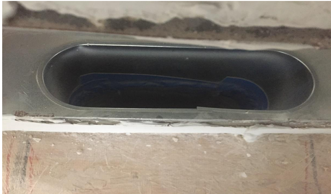
Figure 12-3. Sealing Cold Air Return Joints