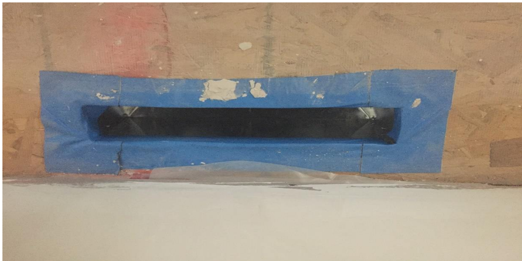
Figure 12-2. Sealing In-Floor Heating Ducts