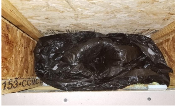
Figure 12-1. Plastic Bag Inserted Into Future Fan Vent Duct.