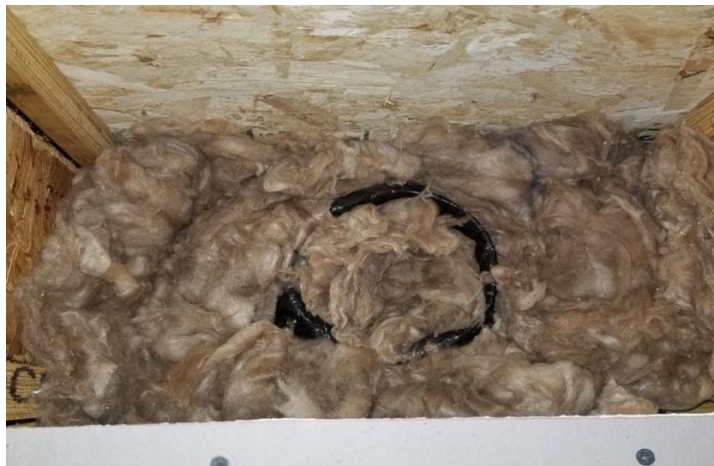
Figure 12-2. Insulation Filled Around Future Fan Vent Duct.