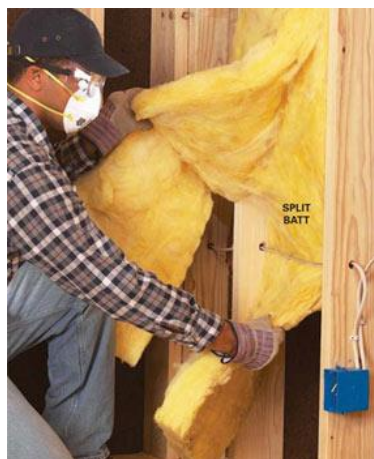
Figure 12-6. Insulating Around Electrical Wires.