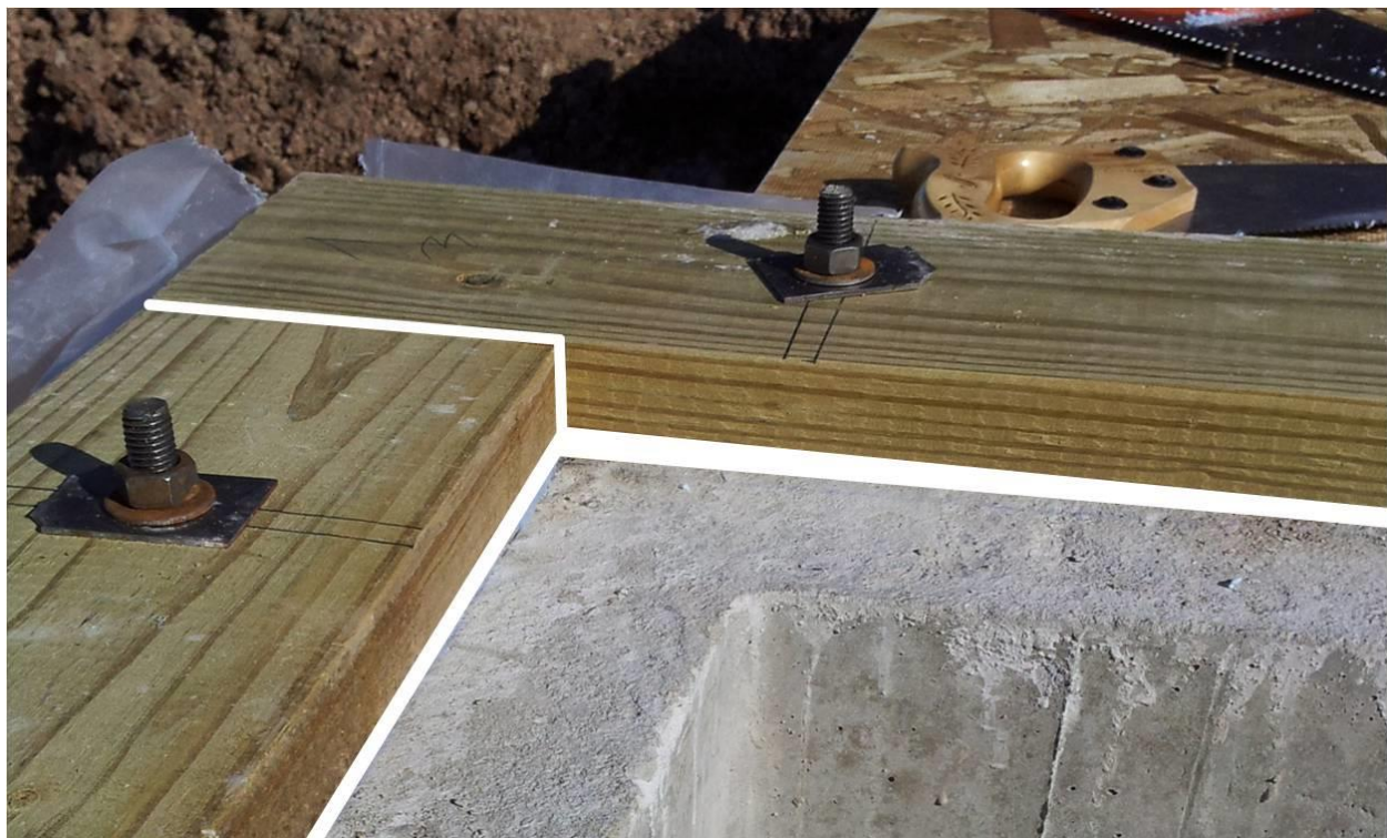
Figure 1-3. Sill Plate Installation.